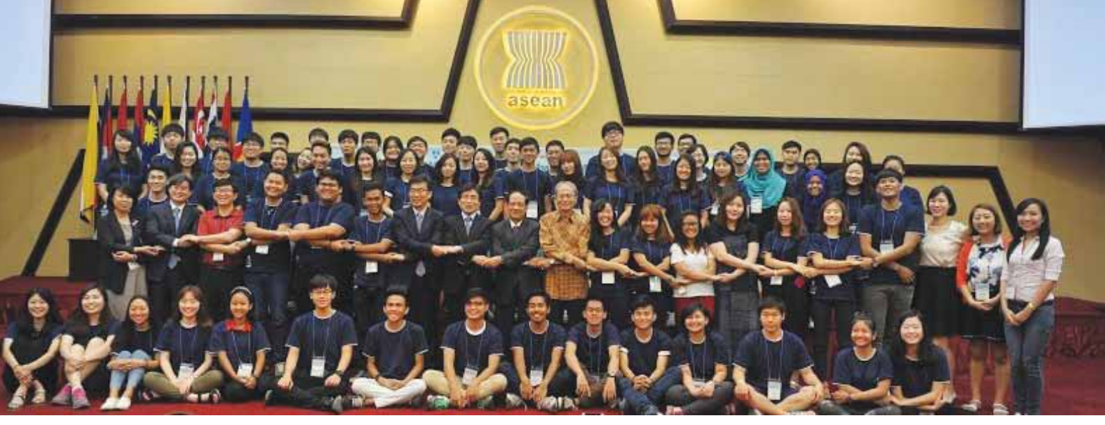
Young people join hands in building the ASEAN Community.

The ASEAN Inter-governmental Commission for Human Rights (AICHR), established in 2009 as the first sub-regional human rights institution in the Asia-Pacific, and the ASEAN Human Rights Declaration adopted in 2012 have established a framework for human rights cooperation in the region and continued to mainstream the issue of human rights in all three pillars of ASEAN.